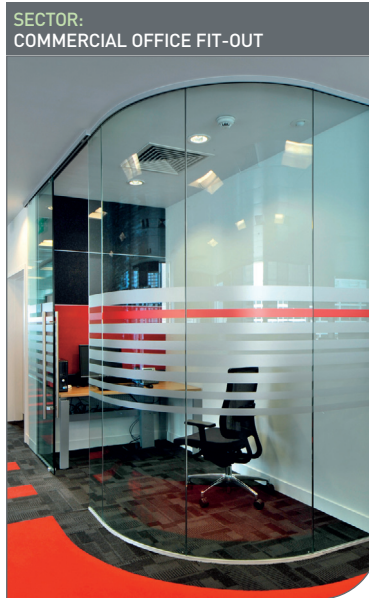
SECTOR: COMMERCIAL OFFICE FIT-OUT