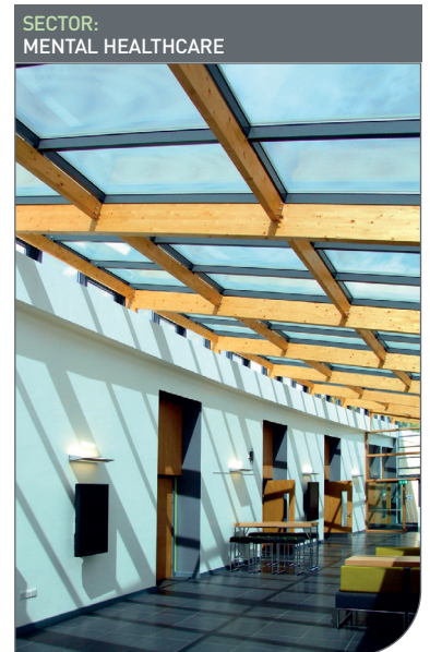
SECTOR: MENTAL HEALTHCARE